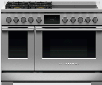
A FREESTANDING RANGE 30", 36" OR 48"