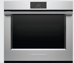
AND A BUILT-IN OVEN 24" OR 30"